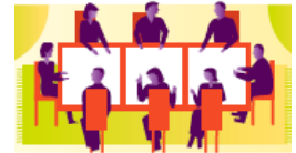
Three tables seat 8 people.

3. In a banquet room, there are small square tables that seat one person on each side. These tables are pushed together to create a rectangular table that seats 20 people.